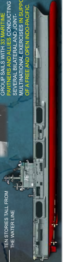
TEN STORIES TALL FROM THE WATER LINE

THE RONALD REAGAN CARRIER STRIKE GROUP SAILS WITH 33 MARITIME PARTNERS AND ALLIES CONDUCTING SEVERAL BILATERAL AND JOINT-MULTINATIONAL EXERCISES IN SUPPORT OF A FREE AND OPEN INDO-PACIFIC.